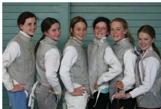
The Swords Club U13 Girls (from left to right):